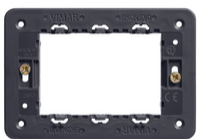
21613 - Frame 3M +screws