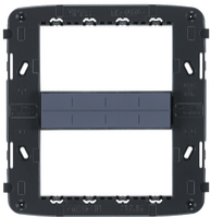
21618 - Frame 8M with screws