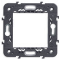
21603 - Frame 2M without screws 71mm