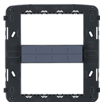
21618 - Frame 8M with screws