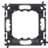
30603 - Frame 2M without screws 71mm