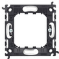
30602 - Frame 2M + claws 71mm