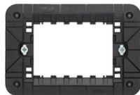
30613 - Frame 3M + screws