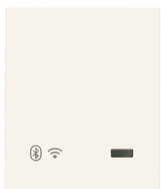
30807.B - IoT connected Gateway 2M white