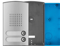
40142 - 2-family audio entrance panel