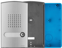
40141 - 1-family audio entrance panel