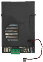
40131 - Audio electronic unit 2F+