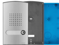
40141 - 1-family audio entrance panel