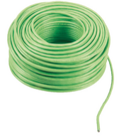
732I.E.500 - 2F+ LSZH cable 2x1 ext. laying Eca 500m