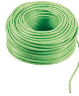
732I.E.100 - 2F+ LSZH cable 2x1 outer laying Eca 100m