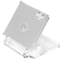
40596 - Tab 7 Up desktop