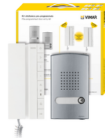
K40542.E - Entryphone kit 2F+ 1-fam. 40542+40141