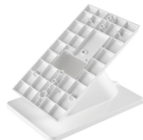
40598 - Voxie desktop white