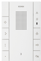
40547 - Voxie interphone 2F+ 7-button white