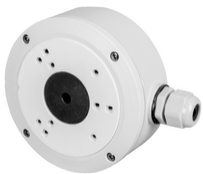
46922.040 - IP camera contacts bracket