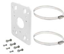
46917.005 - Pole bracket IP cams