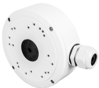
46922.041 - IP camera contacts bracket