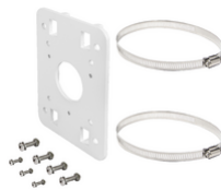
46917.005 - Pole bracket IP cams