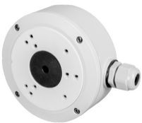
46922.040 - IP camera contacts bracket