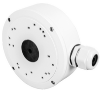
46922.041 - IP camera contacts bracket