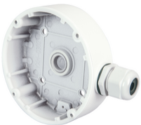
46922.042 - IP camera contacts bracket