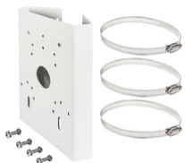
46917.002.01 - Pole bracket for IP Bullet/SpeedDome