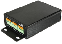
46936.001 - USB alarm extension