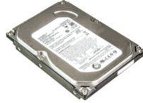
46925.030 - Professional HDD SATA 3,5in 3TB f/DVR