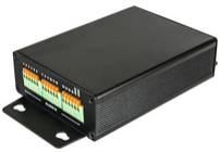
46936.001 - USB alarm extension