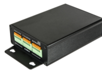
46936.001 - USB alarm extension