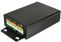
46936.001 - USB alarm extension