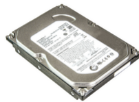
46925.030 - Professional HDD SATA 3,5in 3TB f/DVR