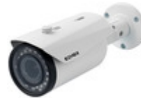
4651.2812ES - Bullet AHD cam 5Mpx 2,8-12mm