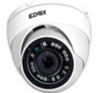
4652.036ES - Dome AHD cam 5Mpx 3,6mm