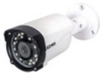
4651.036ES - Bullet AHD cam 5Mpx 3,6mm