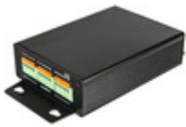
46936.001 - USB alarm extension