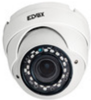
4652.2812ES - Dome AHD cam 5Mpx 2,8-12mm