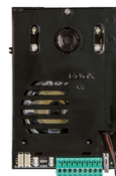
13F2.1 - Due Fili Plus A/V unit