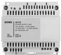
40110 - Supply unit 2F+ 100-240V 1 OUT 1,6A