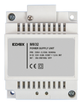
M832 - Safety transformer 230V 12Vac 35W