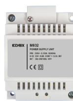
M832 - Safety transformer 230V 12Vac 35W