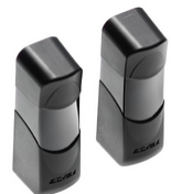
EFA1 - Pair of 12/24V 110mA 180° photocells 15m