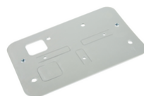
ZX16 - ACTO 400D/ACTO 600D fixing plate