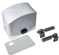
ESM2.W - ACTO 600D slid.act. 24V 600kg for Wi-Fi