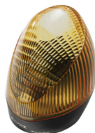
ELA5 - Flashing light LED 12/24Vdc