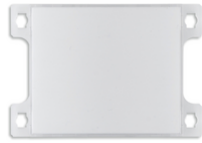
40171 - Button kit for entrance plate 40170