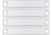
40174 - 4 buttons kit for entrance plate 40170