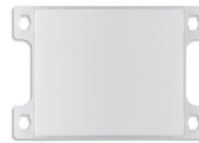
40171 - Button kit for entrance plate 40170