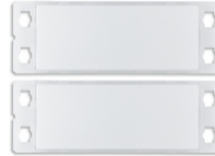
40172 - 2 buttons kit for entrance plate 40170