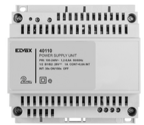
40110 - Supply unit 2F+ 100-240V 1 OUT 1,6A