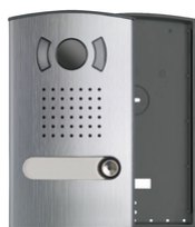
40151 - Audio/Video color entrance panel 1Fam.