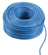
732H.E.100 - 2F+ PVC cable 2x1 intern.laying Eca 100m