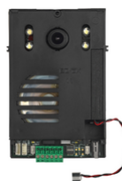
40135 - Audio/Video unit 2F+