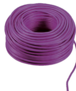
732I.C.100 - 2F+ cable 2x1 LSZH Cca 100m purple