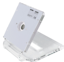
40595 - Tab 5 Up desktop