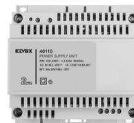
40110 - Supply unit 2F+ 100-240V 1 OUT 1,6A