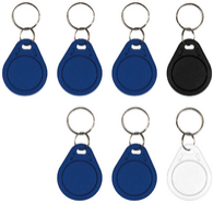
40169 - 7 Mifare RFID keys