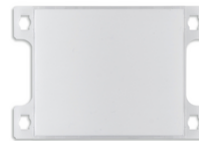
40171 - Button kit for entrance plate 40170