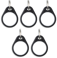
40175 - 5 MIFARE RFID keys