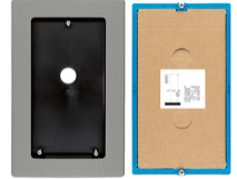
40179 - Semi-flush accessories for plate 40170