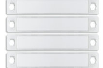
40174 - 4 buttons kit for entrance plate 40170