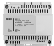
40110 - Supply unit 2F+ 100-240V 1 OUT 1,6A