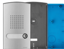
40141 - 1-family audio entrance panel