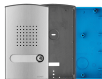
40141 - 1-family audio entrance panel