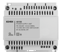
40100 - Interphone supply unit 2F+ 100-240V 0,6A