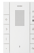
40547 - Voxie interphone 2F+ 7-button white