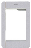
41131.01 - Pixel frame+plate 1M grey