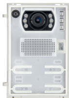
41006.1 - IP A/V wide-angle teleloop unit