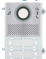
41105.01 - Pixel A/V Teleloop front module grey