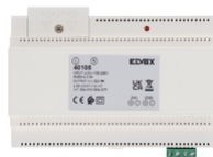
40105 - Power unit DIN 100- 240V~ 50/60Hz 32Vdc