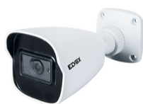
4621.2812BA - IP IR Bullet cam 2Mpx - 2,8-12mm A.V.