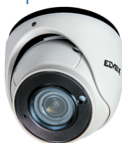
4622.2812BA - Dome IR IP 2Mpx cam - 2,8-12mm Mic A.V.