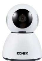
46239.040A - PT Wi-Fi Full- HD cam - 1080p 4mm