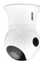
46241.036A - Outdoor PT Wi-Fi cam Full-HD - 3,6mm