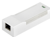
40168 - Converter IP/2-wire for cams