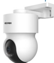
46241.030B - Outer Wi-Fi PT 1080p cam - 3mm