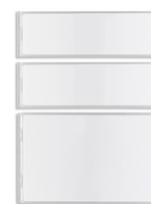
42920.K - 1-2-4 button kit for RFID Video kit plat