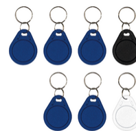
40169 - 7 Mifare RFID keys