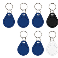
40169 - 7 Mifare RFID keys