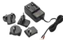
40104 - Supply unit 100-240V~24Vdc 1A EU UK AU US