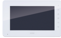
K42932 - Additional 7in monitor DIN power supply