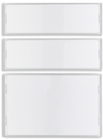
42920.K - 1-2-4 button kit for RFID Video kit plat