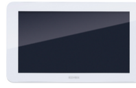
K42917 - 7in video touch internal unit plug-in