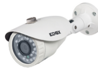
46CAM.136B.8 - Bullet IR AHD cam1080p 3,6mm lens CVBS