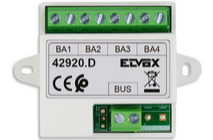
42920.D - Bus distributor 4 outs Video RFID kit