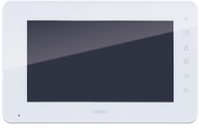
K42912 - 7in video internal unit plug-in supply