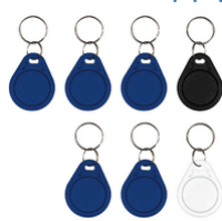
40169 - 7 Mifare RFID keys