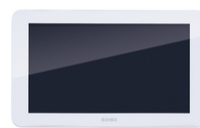
K42937 - Additional 7inTSmonitor DIN power supply