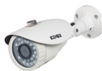
46CAM.136B.8 - Bullet IR AHD cam1080p 3,6mm lens CVBS