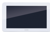
K42917 - 7in video touch internal unit plug-in