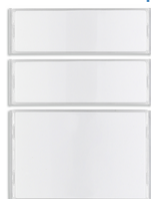
42920.K - 1-2-4 button kit for RFID Video kit plat