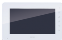
K42932 - Additional 7in monitor DIN power supply