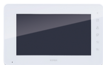
K42912 - 7in video internal unit plug-in supply