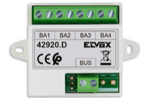
42920.D - Bus distributor 4 outs Video RFID kit