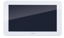
K42937 - Additional 7in TS monitor DIN power supply