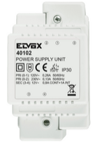
40102 - Entryphone supply unit SS120/230V~ 50/60