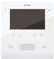
7559 - Video entryphone Tab Free 4.3 2F+ white