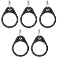
40175 - 5 MIFARE RFID keys