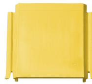
V70191 - Joint plate for junction boxes yellow