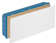
V70010 - Flush junction box 515x201x80mm