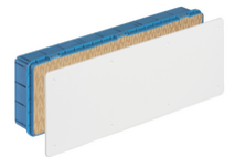
V70009 - Flush junction box 479x154x70mm