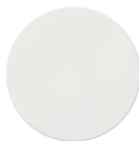
V71632 - Flat cover 2M