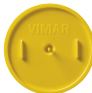
V71011 - Antimortar cover for ø60mm box yellow