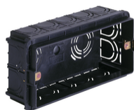
V71305.AU - Flush mounting box 5M black