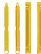
V71563 - Joint plate for flush-mount boxes yellow