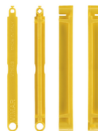
V71563 - Joint plate for flush-mount boxes yellow