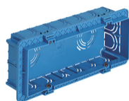
V71306 - Flush mounting box 6-7M light blue