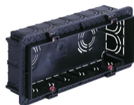
V71306.AU - Flush mounting box 6-7M black