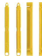
V71563 - Joint plate for flush-mount boxes yellow