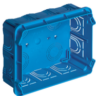
V71320 - Flush mounting box 12-14M light blue