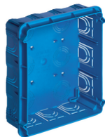
V71321 - Flush mounting box 18-21M light blue