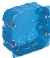
V71718 - Flush-mount box 8M f/hollow walls blue