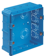
V71318 - Flush mounting box 8M light blue