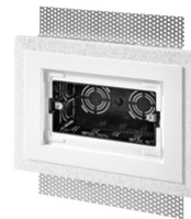
V71794 - Box 4M for Exé flush-wall plate