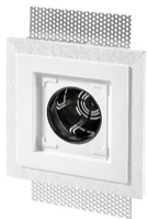
V71791 - Box 2M for Exé flush-wall plate