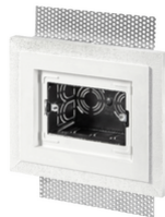
V71793 - Box 3M for Exé flush-wall plate