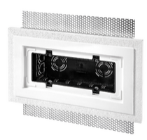
V71796 - Box 7M for Exé flush-wall plate