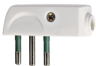
00206.B - 2P+E 10A SPA11 90°-plug white