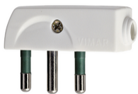
00207.B - 2P+E 16A SPA17 90°-plug white