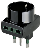
00323 - S17 multi-adaptor+2P17/11+P30 out. black